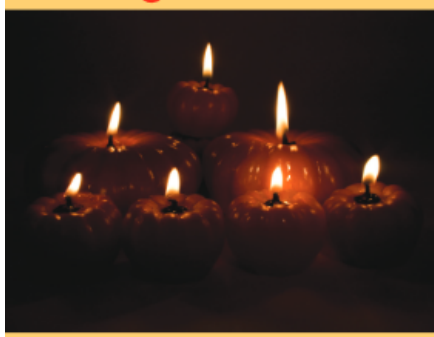
Decorations are the first thing to ignite in 900 reported home fires each year. Two of every five of these fires were started by a candle.